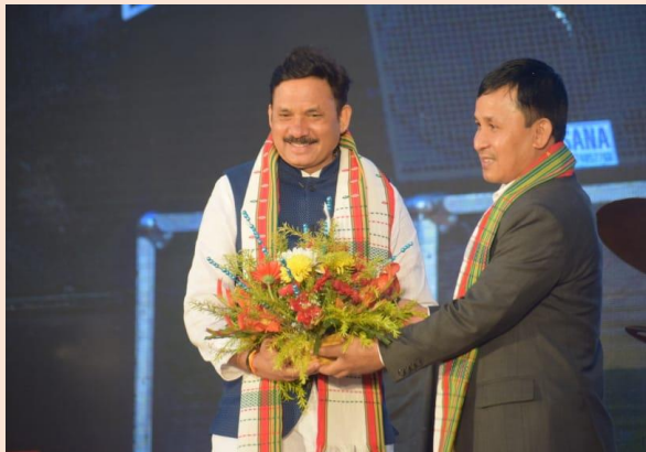
Welcoming Shri Devusinh Chauhan, Hon'ble Union Minister of Communications