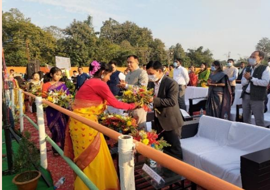
Presentation of Bouquets to the Dignitaries