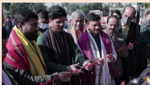
Inauguration of Farmers' Welfare Department Stall, Govt. of Tripura