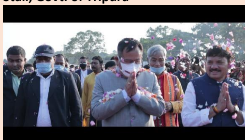
Welcoming Dignitaries by showering Flower Petals