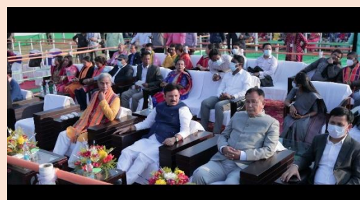
Dignitaries witnessing the Cultural Programmes