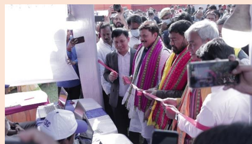
Inauguration of e-Shram Card Stall of Ministry of Labour & Employment, GoI