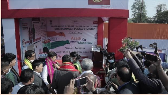
Inauguration of Deptt of Posts, Gol