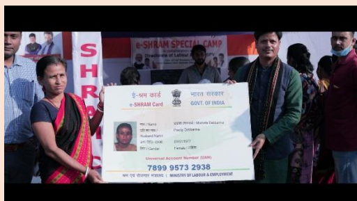
Launch of e-SHRAM Card by Shri Bhagaban Chandra Das, Hon'ble Minister, Tripura