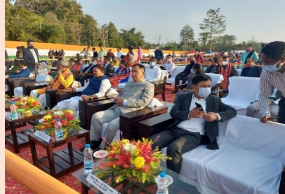
Dignitaries witnessing Cultural Programme