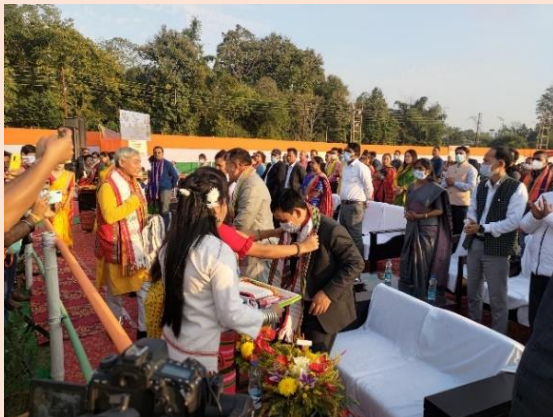
Dignitaries being Greeted at the Venue