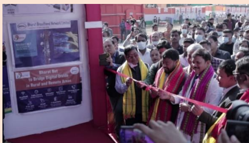
Inauguration of BBNL Stall