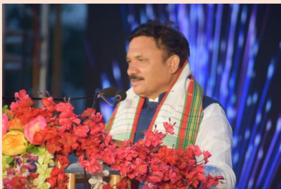
Address by Hon'ble Communications Minister, Gol