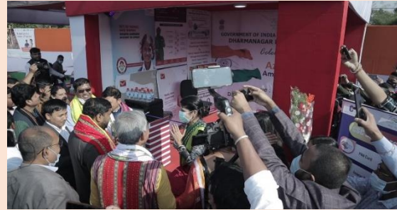
By Union Minister of Communications